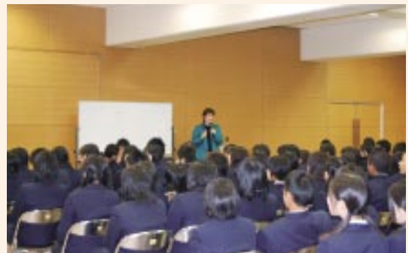
▲At Kokura Commercial High School, Kokura, Kitakyushu, Japan

It is hoped that these programs provide opportunities for the students to think independently about planning their lives, in terms of how to get involved in their local communities, how to choose their occupations, how to work, and how to strike a balance between family and career.