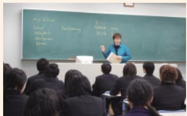
▲At Kyushu International University High School, Yahata, Kitakyushu, Japan