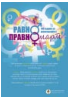
▲ Campaign "100 years for Gender Equality - Celebration of 8, March"

Different campaigns to promote gender equality are conducted every year: (1) "Family without Violence"-a campaign on prevention and combating domestic violence; (2) "EQUAL for Rural Women"-a campaign for improvement of life quality for rural women; (3) "White Ribbon - Man say NO to Violence against Women and Girls"-a campaign that emphasizes the role of men in combat violence against women and girls; (4) "Choose EQUAL"-a campaign on raising public awareness of the need and importance of greater participation of women in public and