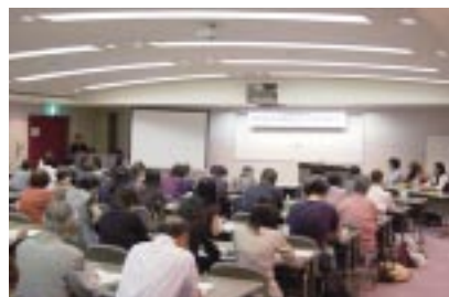
▲First session “World Report”

On October 2 nd 2010, KFAW held the World Report “Domiciled Foreign Women and Local Community” at Kitakyushu Municipal Gender Equality Center MOVE. Over 130 citizens including NGO/NPO workers, members of women’s group and volunteers joined this seminar. Participants listened intently to panelists’ reports. Three domiciled foreign women who are from China, Indonesia and the Philippines reported on their experiences in Kitakyushu in Japanese.