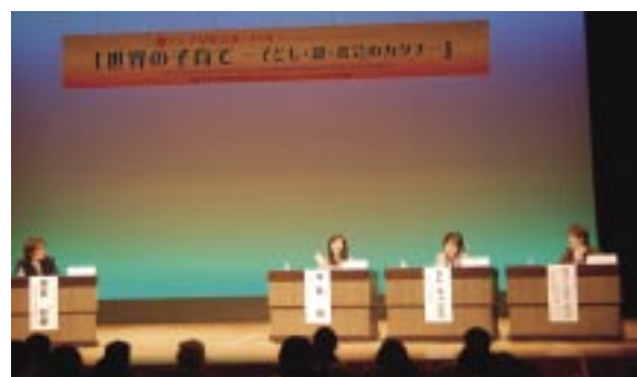
▲During the panel discussion

Today, Korea’s declining birthrate is a serious problem, leading to a substantial increase in money budgeted to solve this matter. However, most of these budgets relate to childbirth. Future challenges include providing support for child rearing. It is necessary also to further the promotion of democracy and gender mainstreaming.