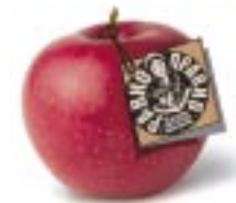
▲ Campaign - "EQUAL for Rural Women!"

To promote women's very important role in society and to improve their quality of life, Gender Center of Republic of Srpska Government conducted a campaign of "EQUAL for Rural Women". This campaign marked the 15th October - World Rural Women's Day. Also, in collaboration with the Republic of Srpska's Ministry of Agriculture, Forestry and Water Management, the "Action Plan for Improving the Situation of Rural Women 2009-2015" is being carried out.