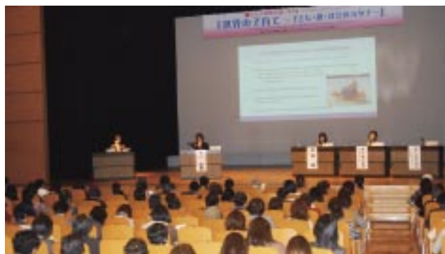
▲Venue (about 400 people participated in)