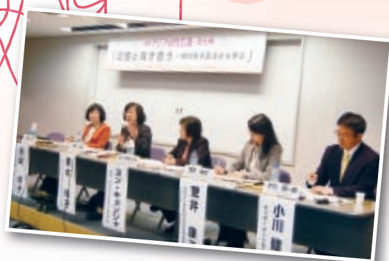
The 22nd Kitakyushu Conference on Asian Women