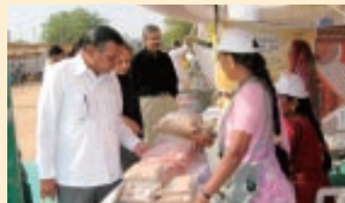
▲Indian women selling organic agricultural products produced by them

The concept of social business reflects the changing trends in development assistance — from providing services to capacity building and empowerment. Social business presents a new approach to encourage participation in economy and society and sustainable development for poor women who have tended to be considered irrelevant to doing business. It is hoped that many more companies which enter developing countries will contribute to the improvement of local people's lives, in particular those of poor women.