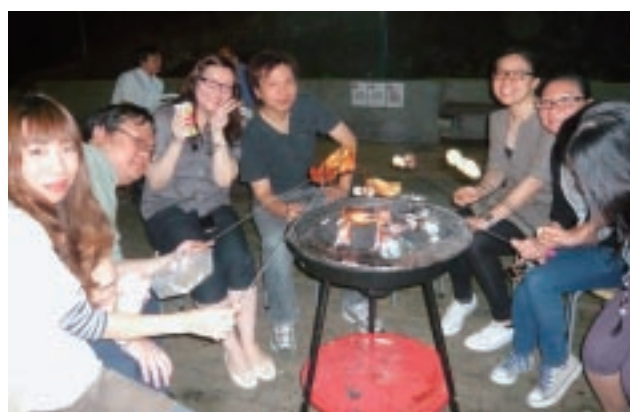
▲Young People Enjoy a BBQ in Hong Kong

the clock.) In addition, their prices are reasonable, making them attractive to many young customers. The reason for their popularity lies not only in their prices and convenience, but also in the “diversity” and “unusualness” of their menu items, which are unavailable in other types of restaurants. Cha chaan teng menus list more than 50 types of dishes in total, including ordinary snacks (Western dishes, such as sandwiches, toast, spaghetti, and pilaf), Chinese dishes (rice porridge, noodles, and rice, vegetable, meat and fish dishes), plus patisserie (egg tarts, French toast, melon-flavored buns, and rolls). Moreover, each cha chaan teng has its own particular menu specialties. Drinks served at cha chaan teng also tend to be unique. They offer not only tea and coffee, but also yuanyang (a mix of coffee and milk tea), cola with lemon juice, Milo, watercress-flavored honey drink, etc. While many young people began going to cha chaan teng in their childhood, they never tire of it. This is due to the menu dishes’ “diversity” and “unusualness.”