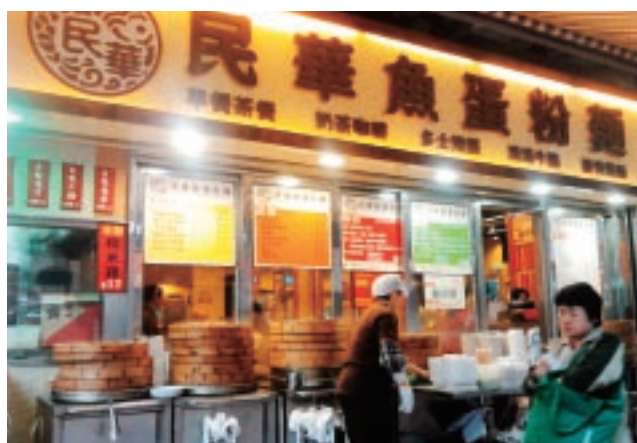
▲Popular cha chaan teng

On weekends, many young people in Hong Kong have a barbecue to enjoy something unusual that they cannot experience in their daily life. Numerous barbecue sites in the suburbs draw many young people on weekends. Hong Kong also has a lot of barbecue shops, where you can purchase barbecue foodstuffs and equipment. Also, there are barbecue sections in supermarkets, indicating the vast popularity of this leisure activity. Food trends among young people in Hong Kong are deeply related to their notable fondness for “diversity” and “unusualness.”