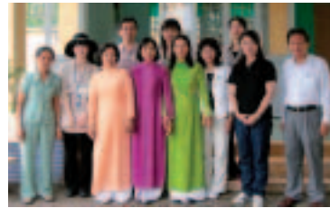
▲With elementary school teachers in Cu Chi

In southern Vietnam, the project team members visited an elementary school founded by a Japanese NPO, Niigata International Volunteer Center, in a joint effort with the Women's Charity Association Ho Chi Minh. This school is located in the Cu Chi District in the suburbs of Ho Chi Minh. Although the project team visited the school during the summer vacation, they were given opportunities to observe three classes at the school, and ask teachers about the Vietnamese educational system.