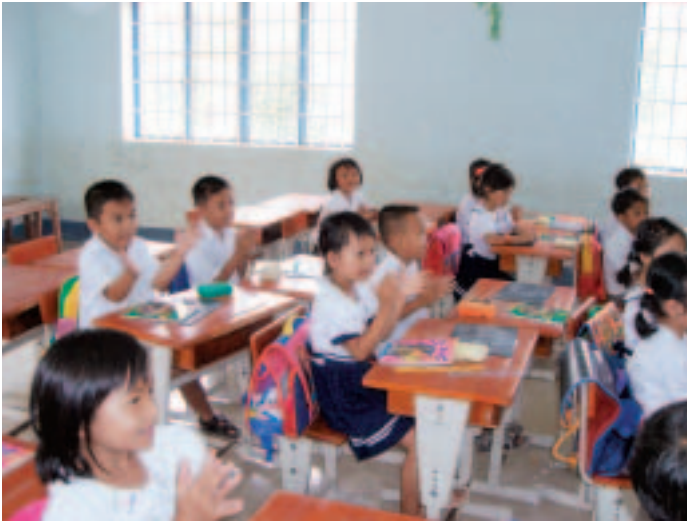
▲First grade class in Cu Chi