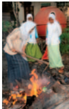
▲ Women in Aceh work energetically

Furthermore, the destruction of the economy eliminates almost entirely the utility of the skills possessed by men. Immediately after the disaster and many months afterward, there were no opportunities for farmers, fishermen, cab drivers and civil servants to ply their trade. On the other hand, it turned out that the domestic skills possessed by women became a quick and easy way to earn extra cash. Thus, many aid groups furnished them with low cost items like sewing machines, stoves and basic materials like flour and spices in order to commercialize activities like sewing and cooking. These activities, regardless of how menial they are, not only give women a sense of economic independence, but also steer their focus towards the future rather than the past. Unfortunately, such resilience is tampered by societal expectations. Used to having a family (or, according to some locals, having acutely realized the impermanence of life), many sought to (re)marry and (re)build a family. Single women and widows found themselves courted by single men and widowers mere weeks after the tsunami. One may expect that once the traditional nuclear family structure is (re)assembled and the economy (re)structured, original role ex-