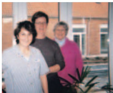
▲An Iranian care worker; a director of a welfare institution for the elderly; and a civil servant, Naestved city, Denmark

Based on studies of reports submitted from Denmark, Germany and Italy, KFAW researchers found that Denmark was the most eager to provide migrant workers with opportunities to learn the language and daily customs of the host country. In addition to training programs for care workers as well as other professions, language programs are generally provided for two or three years, the length varying according to individual municipalities. In Denmark, target audiences of such training programs are primarily refugees, their families and their second generation, who have Danish citizenship and would probably live in Denmark for life.