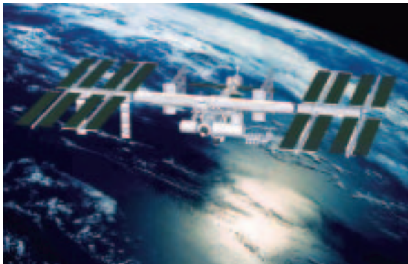
▲The International Space Station (ISS)

space travel. I believe that the age will come when so many more people can travel into space. Then they may ask “What is an ‘astronaut’? Was the term ‘astronaut’ once used?”