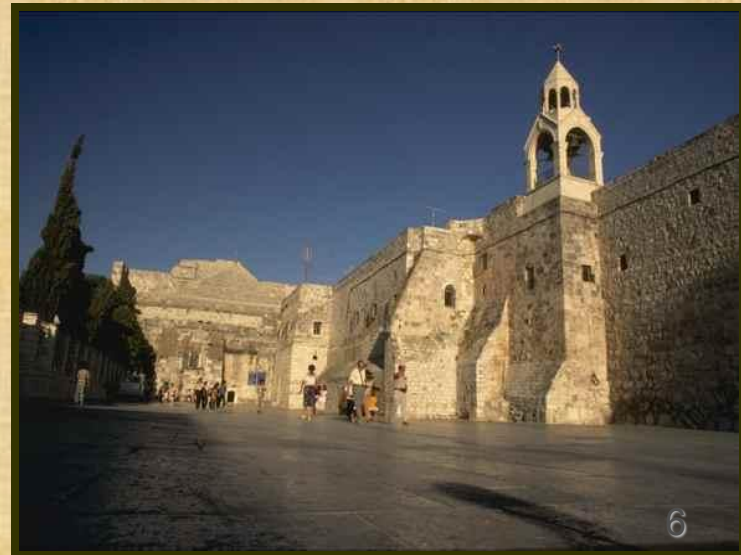
Bethlehem Nativity Church