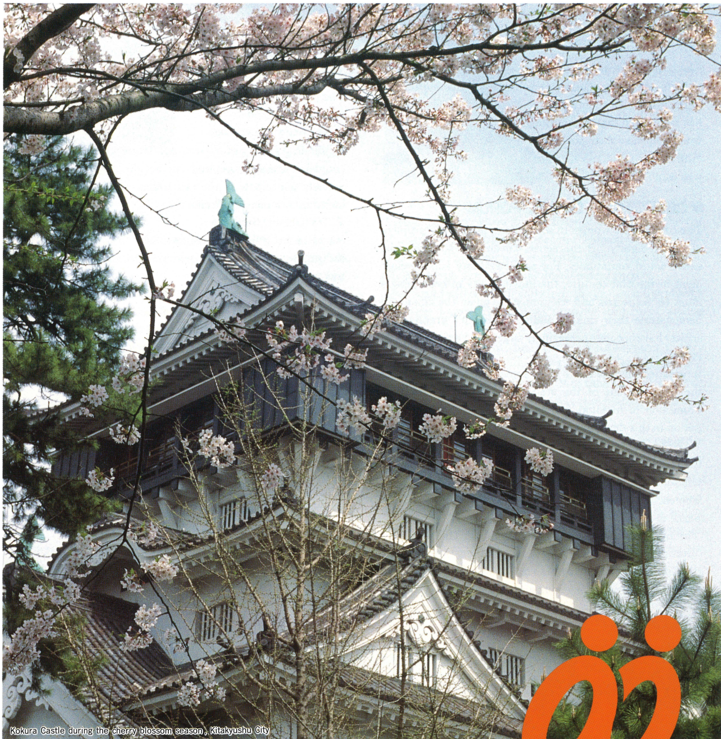
Kokura Castle during the cherry blossom season, Kitakyushu City