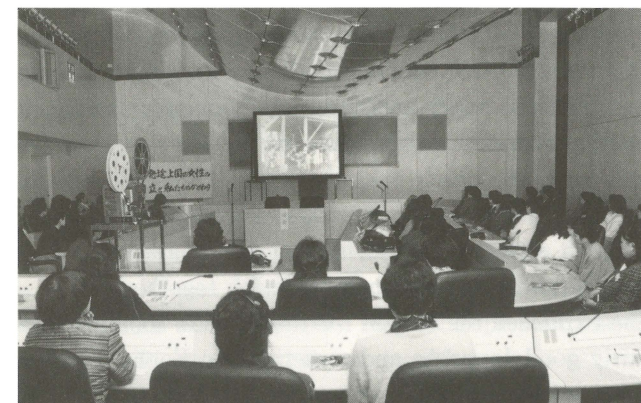
▲Workshop—BPW(National Federation of Business and Professional Women's Clubs of Japan, Kitakyushu Club)