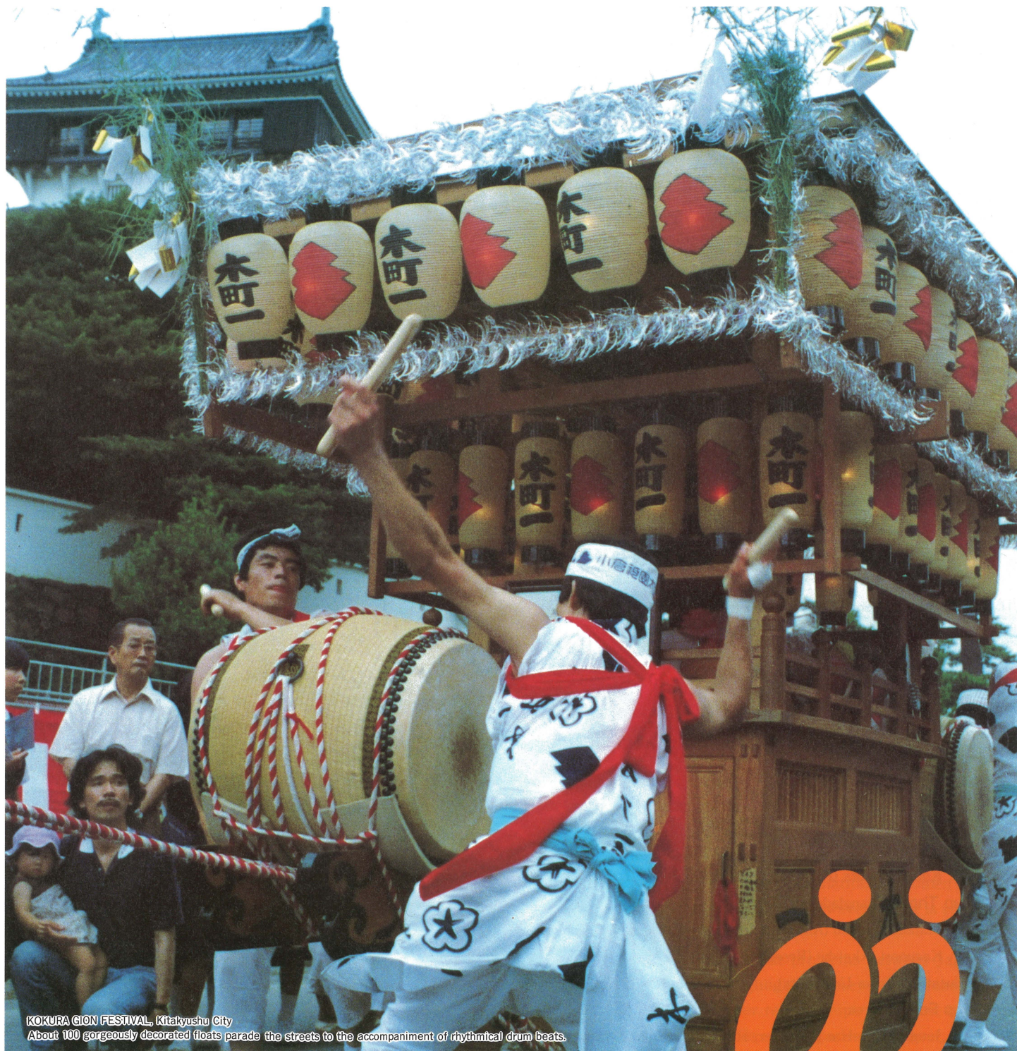
KOKURA GION FESTIVAL, Kitakyushu City About 100 gorgeously decorated floats parade the streets to the accompaniment of rhythmical drum beats.

1st KITAKYUSHU CONFERENCE ON ASIAN WOMEN WOMEN TODAY DOMESTIC AND OVERSEAS INFORMATION OFFICIAL OVERSEAS VISITS THE FORUM WINDOW