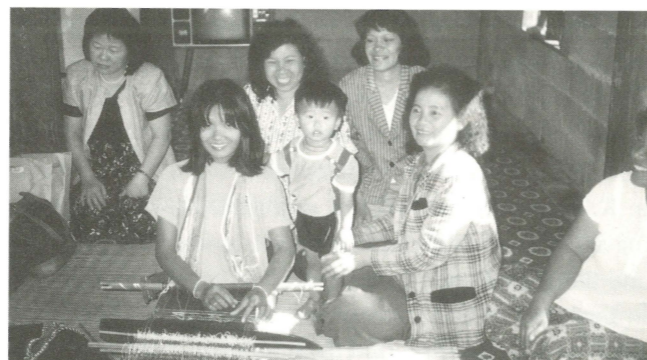
▲ A woman weaver from Ban Pah Tung Village