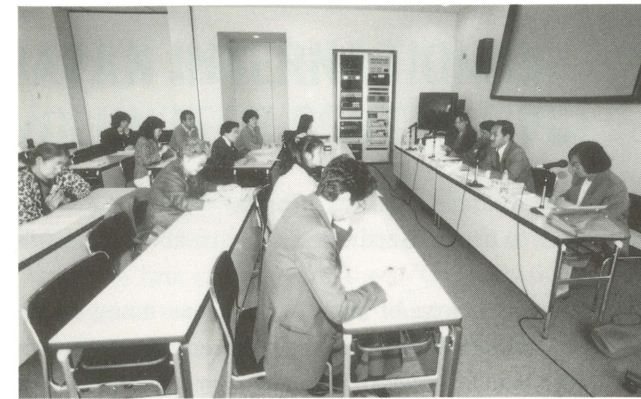
▲Group Three: Bangladesh

One important point made at the Conference concerned Japan's economic support to Asian countries. Often this support is principally allocated towards large scale projects and does not reach the people. In the future, Japanese aid should be sent to help Asians become more independent. Japan should also support activities at the grass-roots level through non-governmental organizations. In addition, Japan through its aid, must encourage Asian men and women to look for best solutions to their problems.