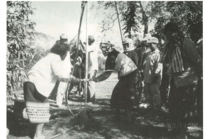
▲Laotian mothers working together to dig a well for fresh water

For more information regarding JVC activities, please call 03-3834-2388 (JVC Tokyo headquarters, Tsukamura or Shibata). (Yasufumi Tsukamura researcher )