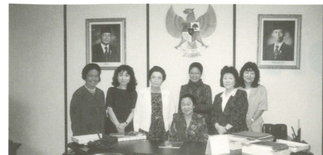
▲ Staff of Indonesian Ministry of women issues and Kitakyushu Forum on Asian Women Representatives with Minister of State for the Role of Women (ctr.)

Ban Tan Nua, a small cotton weaving village about 100km northeast of Chiang Mai, has a center where there are six looms at which women weave at their convenience. At Ban Tan Nua, a two hour drive from Ban Pah Tung, they are trying to develop new weaving patterns as well as preserve the traditional ones.