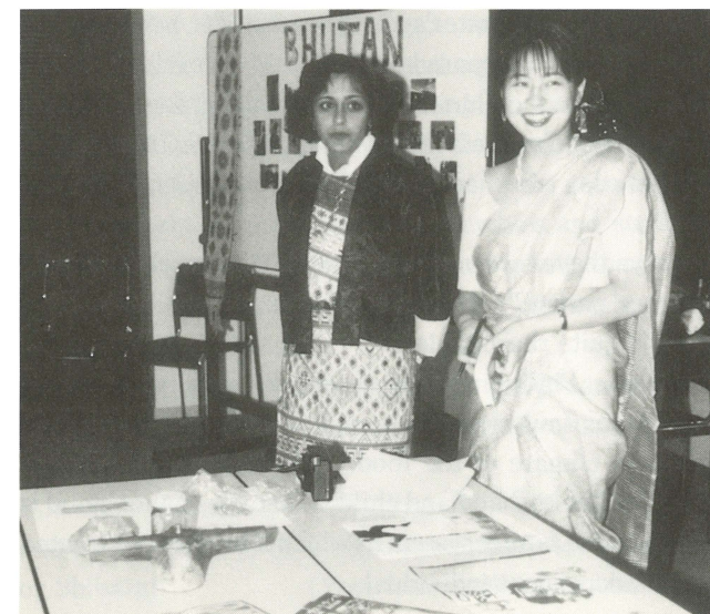
▲Workshop—GMC(Global Mates Club)