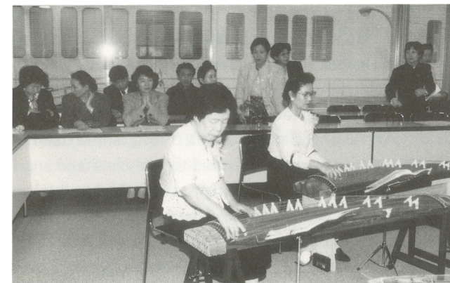
▲Workshop—OASC(Our Asian Seminar Circle)