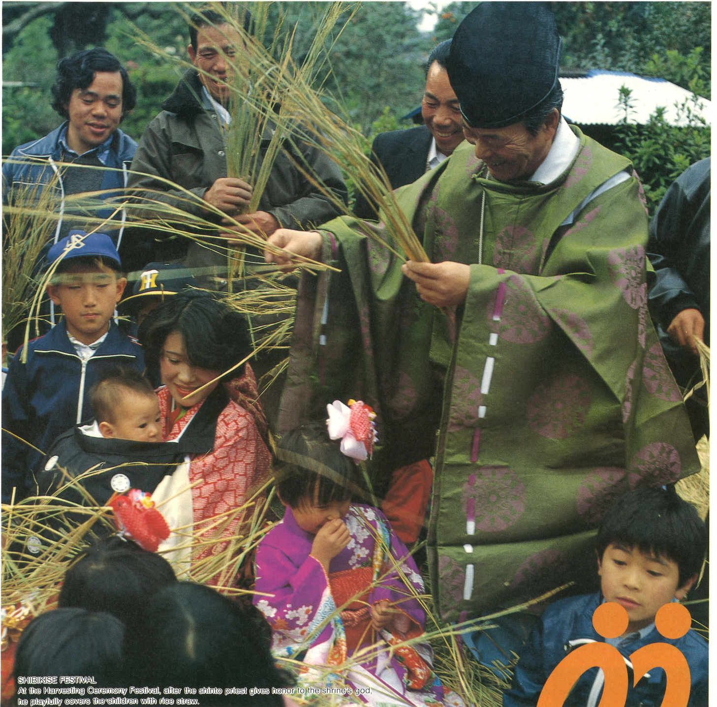
SHIBIKISE FESTIVAL At the Harvesting Ceremony Festival, after the shinto priest gives honor to the shrine's god, he playfully covers the children with rice straw.

SYMPOSIUM WOMEN TODAY SEMINAR STUDENTS' STUDY TOUR DOMESTIC AND OVERSEAS INFORMATION THE FORUM WINDOW