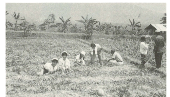
▲At OISCA Training Center

On that day, they participated in an exchange party hosted by OISCA's supervisors and native trainees later that evening. At the party, they ate goat roasted whole and Indonesian dishes, and danced Bon Odori dances (Summer Festival dances), such as "Tankobushi," around a campfire.