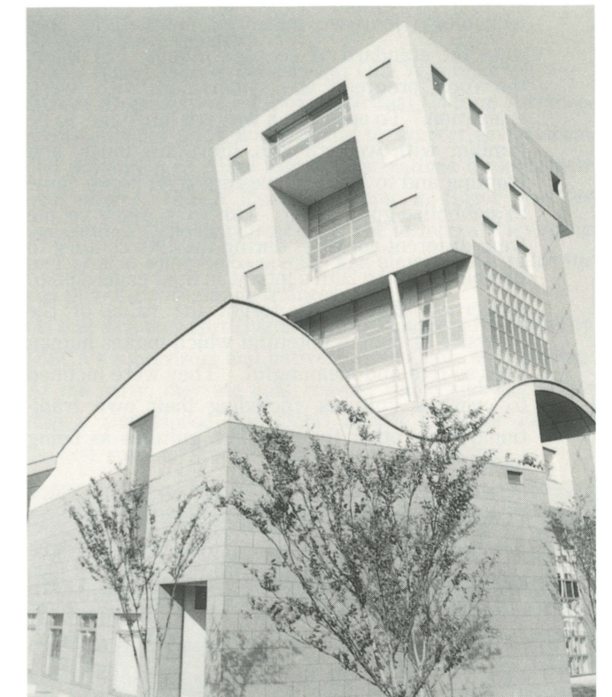
▲Kitakyushu International Conference Center

<Horiuchi> I ask the Forum to do its best to conduct steady and persistent research on Asian women and promote projects focused on women's independence.