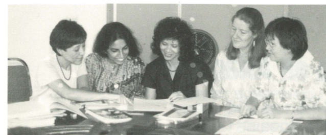
▲Members of the Women Development Program Team