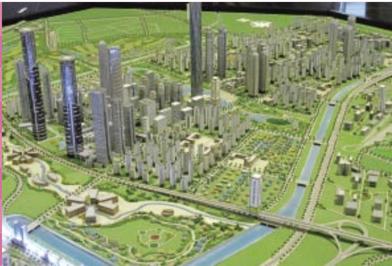
Incheon, Korea's Model for a future compact and smart metropolis

KITAKYUSHU FORUM ON ASIAN WOMEN (KFAW) June 2012 Triannual Publication