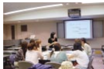
Group Work "Let's think about it together!"

I didn't know that ignoring my partner and getting angry about my partner not answering my e-mails are both dating DV.