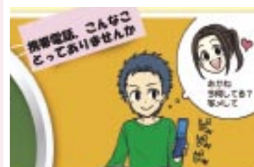
Using Manga and Presenting Examples of Dating DV

I think it's important to say clearly "No" to what I don't like.