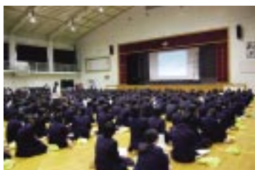
A Facilitator delivering a lecture to Students

In the future, it is expected that each facilitator will continue dating DV prevention education activities at schools and in communities. Facilitators as well will disseminate her experience as a facilitator not only across Japan but also other parts of Asia. At the same time, KFAW will continue to promote a wide variety of activities to develop female resources who can establish themselves in their communities.