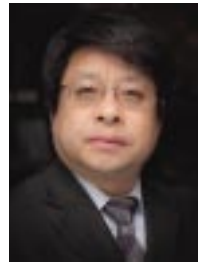
President, Incheon Development Institute KIM Min-Bae

Another area of focus is enhancing women's economic capacity. Entrepreneur schools develop women's potential and train them to be primary drivers of economic activity. Last year, 100 future entrepreneurs were trained and a support center for women entrepreneurs was established with 36 training rooms.