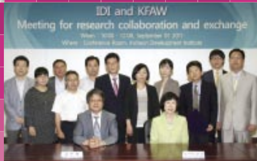
With Incheon Development Institute Staff