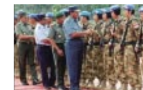
◀Female Soldiers in the Indonesian Army (Koran Baru newspaper)

The transitioning up until the 20th Century from the period of passive women to that of active women did not take place suddenly. In the transition period, many women devoted themselves to social activities via organizations both at central and regional levels. Moreover, diversity in religion, customs, education and lifestyles along with efforts to advance women were tailored to local circumstances. Finally, it can be concluded that the women's movement is the most powerful driving force for change in women's lives.