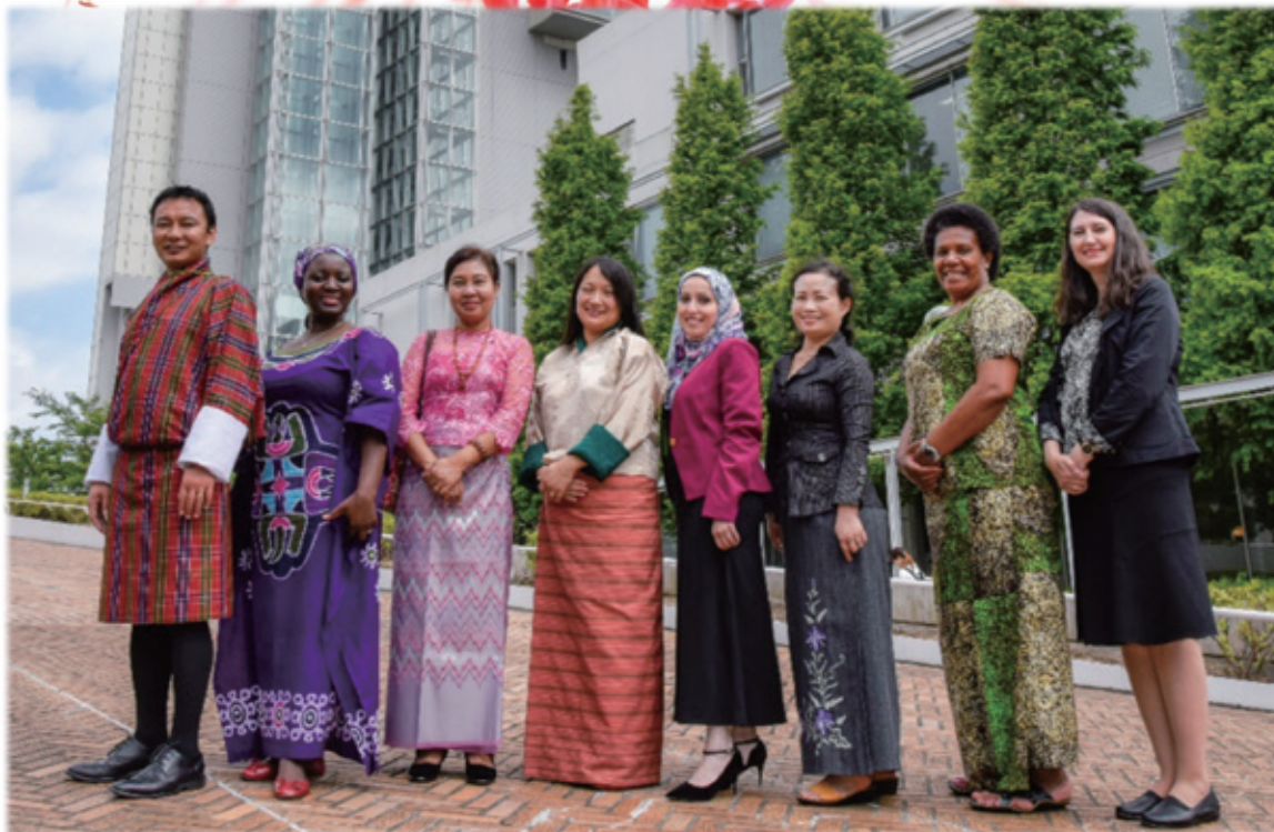
JICA Trainees on "Gender Mainstreaming Policies for Government Officers 2017 (the First)" at the University of Kitakyushu

KITAKYUSHU FORUM ON ASIAN WOMEN (KFAW) November 2017 Triannual Publication