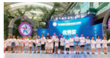
Awards ceremony at the International Child Olympiad Brain Power Competition organized by Early Childhood Education School

This study will make comparisons of early childhood education, "educational families" and the roles of "fathers" between China and Japan by conducting oral surveys in Dalian and Kitakyushu. Then, based on the results, the study will further identify the roles that people around fathers (i.e., teachers and mothers) expect them to play in "educational families" that exemplify enthusiasm for early childhood education in China, as well as the principles fathers have concerning child rearing/education.