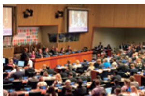
The official meeting of the United Nations High-Level Political Forum

"Transforming Our World: The 2030 Agenda for Sustainable Development", adopted at the United Nations Sustainable Development Summit in 2015, lays out goals and targets that the member states are committed to implementing by 2030.