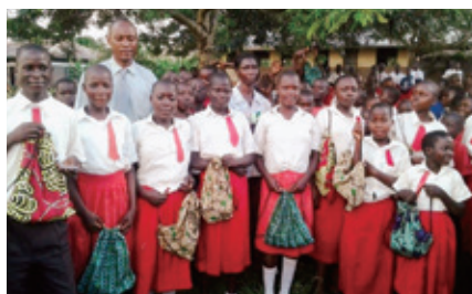
Pupils of a primary school showcasing the reusable pads and carrying bags they have made themselves.

In order to address the situation, both government and non-government actors have undertaken measures to increase awareness about the menstrual hygiene management among all stakeholders including the girls themselves, the boys, parents, school managers, religious leaders, and local communities. The president of Uganda has been committed to improving the menstrual hygiene management through the provision of facilities to the Universal Education schools and the offering of sanitary pads to the adolescent girls in order to stay in school and attain quality education and lifelong learning.