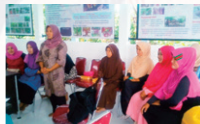
Women cocoa farmers voicing up their concerns in a discussion session.

also necessary. In time, hopefully the women cocoa farmers will finally have the confidence to sit in the front rows, and raise their hands with pride. They will have the courage to say out loud, "We don't just help; we do contribute and therefore deserve acknowledgment".