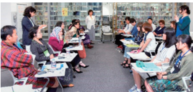
Discussions with university students

In this one-month training program, the participants respected each other and established good relationships by understanding the differences of each country, including Japan. At the end of the training, each participant presented an action plan to promote gender mainstreaming policies in their own countries. They said that they would like to make the best use of the outcomes of the training for their future endeavors.