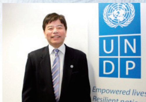
Director of UNDP Representation Office in Tokyo