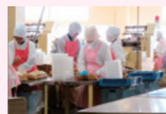
Female employees at a confectionery plant

This year's research study will first investigate the following aspects through oral surveys conducted with manufacturing companies in Kitakyushu: the establishment of a system to accept workers who are raising children, improvement of facilities, awareness raising among the employees, and requests to governments, among others.