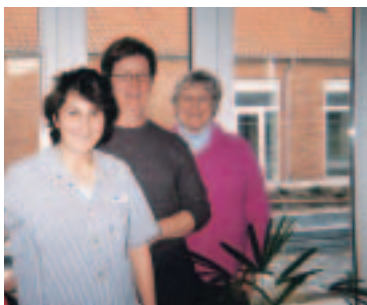
▲An Iranian care worker; a director of a welfare institution for the elderly; and a civil servant, Naestved city, Denmark

Based on studies of reports submitted from Denmark, Germany and Italy, KFAW researchers found that Denmark was the most eager to provide migrant workers with opportunities to learn the language and daily customs of the host country. In addition to training programs for care workers as well as other professions, language programs are generally provided for two or three years, the length varying according to individual municipalities. In Denmark, target audiences of such training programs are primarily refugees, their families and their second generation, who have Danish citizenship and would probably live in Denmark for life.