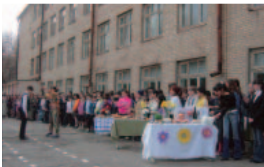
The Navruz Festival in the school courtyard▲

In present-day Uzbekistan, there are still heavy demands and expectations on women to do housework and child rearing. In this context, there are increasingly more cases of women being chosen as mahalla representatives. The mahalla representatives and women's committee members must tackle many problems related to collaboration with schools and aid to women in the mahalla , while balancing these duties with their housework and child rearing responsibilities. The activities of the mahalla women in Uzbekistan encompass the problems faced by the women themselves. The activities carried out by these women are not only for the children's sake but also for the bright future of these women themselves.