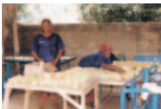
◀ Soap making by local Burkina Faso organization members who are mainly women

nabe women's potential in different fields of competency at national and international levels.