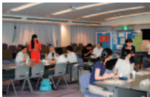
▲At the video promotion meeting

To celebrate the completion of the 7 th program, Vietnam in the series a video promotion meeting was held on Friday, August 3, 2007 at "Move" (the Kitakyushu Municipal Gender Equality Center). Despite the unfavorable weather due to an approaching typhoon, the KFAW was able to hold the meeting as scheduled.