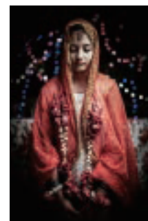
Girl aged under 16 prepared for marriage in Sindh

that child marriage is associated with high maternal and child mortality/morbidity. Further, reports by UNICEF and International Council for Research on Women (ICRW) consisting of data from various countries found that, as compared to those married as adults, women married as children are mostly poor and uneducated, residing in rural areas with limited access to healthcare services. This disproportionate risk of high maternal and child mortality/morbidity seems to be related to their socio-economic, cultural and structural vulnerabilities.