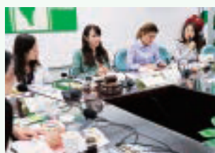
Discussions with city council members in Taiwan, Province of China

Both the central and local governments in Taiwan, Province of China have introduced quota systems and the proportion of female legislators is high. Surveys and analysis on the activities of women in politics in the country may offer considerable suggestions in reforming Japan's political system. In March of this year, we met with three local female politicians in Taiwan, Province of China in their 30s and 40s who had all