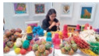
Toquilla straw products handwoven by women artisans