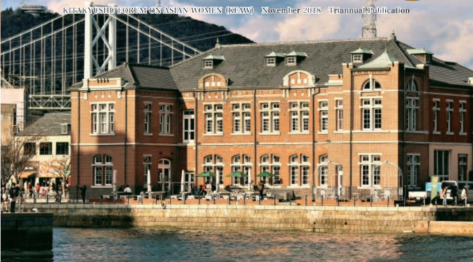
Former Moji Customs House, Kitakyushu

KITAKYUSHU FORUM ON ASIAN WOMEN (KFAW) November 2018 Triannual Publication