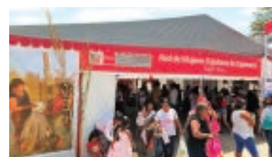
External part of the Workshop Tent of the artisan women's network "Weaving Hopes", which was full of visitors during a sale at a fair.

Currently, there are approximately 200 women who have joined the network, selling their products in shopping centers and at the request of companies. The MIMP has designed the second phase of the intervention to expedite access to the international market that is in the process of being implemented. The strategy of this project helps the women out of violence and poverty as they say: "We feel free and weave hopes of growth for our life free of violence with economic empowerment."