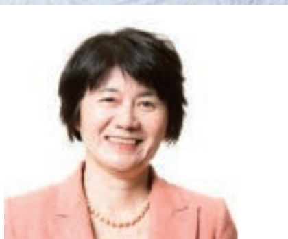
Executive Director of CSO Network Japan