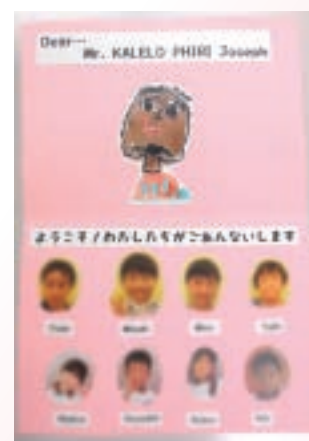
A warm handmade invitation card from children

After the visit, a participant from Palestine said, “I understood that fathers and mothers can go to work thanks to daycare centers in Japan. Child-rearing has been regarded as a mother's task for a long time. However, in Japan, daycare center is now playing an important role for promoting women's participation in the labor market. I would like to improve childcare services in Palestine based on this experience in Japan.” The visit to the daycare center further deepened their understanding of gender mainstreaming.