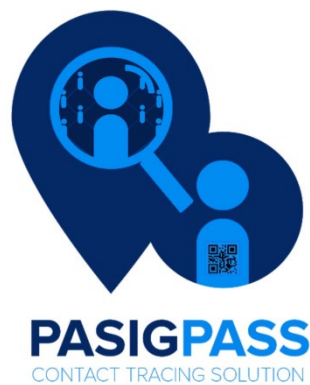
Logo of the Pasig Pass contact tracing program 11

In the small City of Pasig, one of the seventeen municipalities that comprise Metro Manila, a young, first-term Mayor has used ICT to improve local government services to his constituents. Without the compulsion to "plaster" his face into the city projects (as was done in the past and is still being practiced by many traditional politicians) but with new initiatives such as a contact tracing app (one of the earliest in the whole country), an online registration system for "ayuda" (social assistance through cash transfers and in-kind donations) and vaccinations, and even livestreaming of bids/government tenders, 10 the Mayor has shown that, indeed, good governance can be developed in tandem with technology.